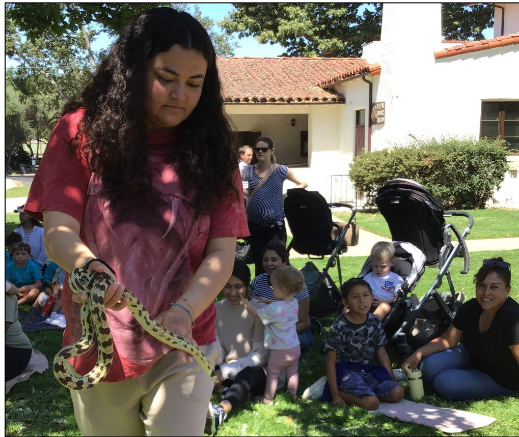
Mahni's Reptiles at Solvang Library (145)