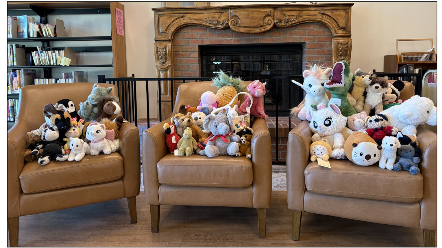
Stuffed Animal Sleepover at Buellton Library (100+)