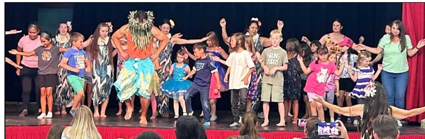
Hula Anyone at Goleta Community Center (78)