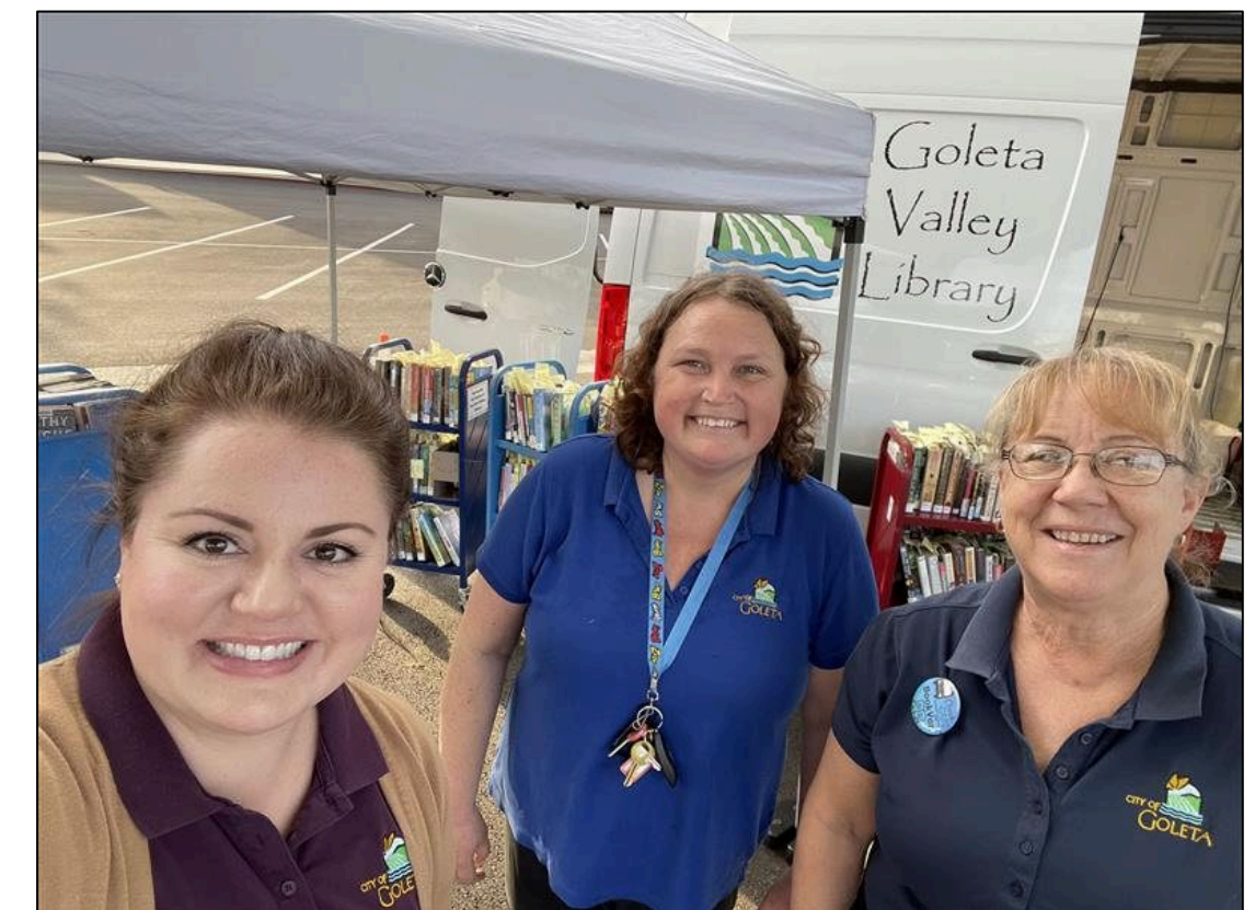
Library Staff at GUSD Stop