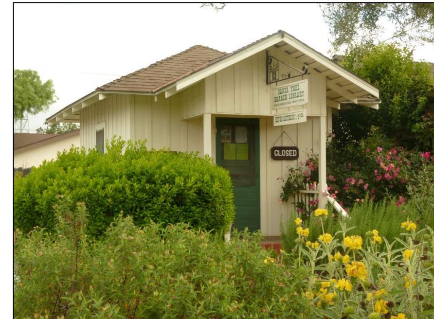
Santa Ynez Library