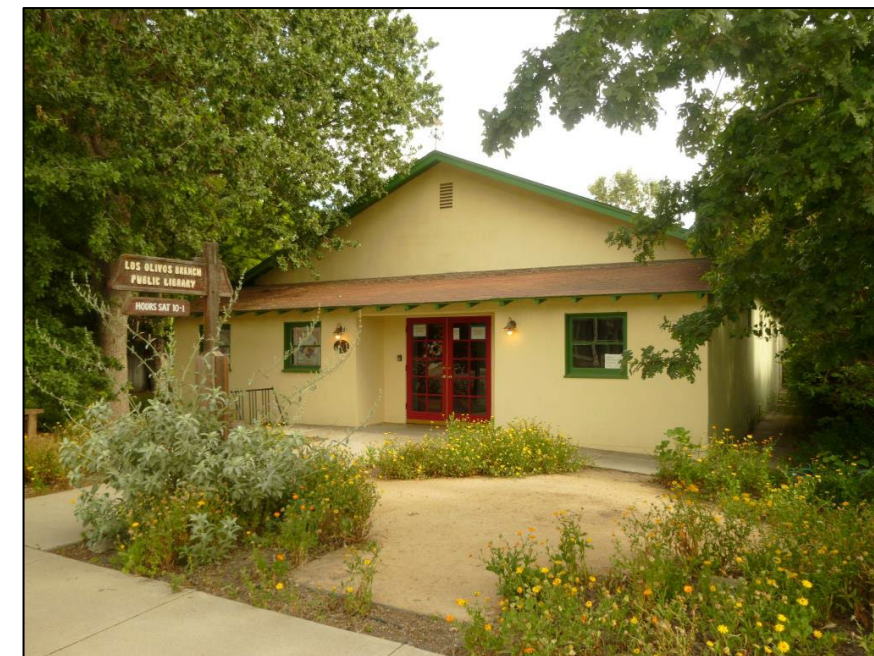
Los Olivos Library