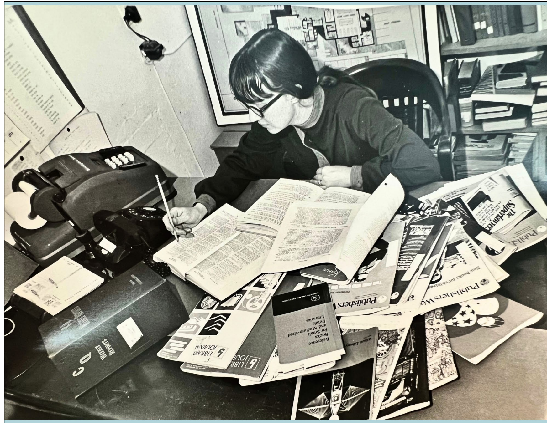
circa 1960