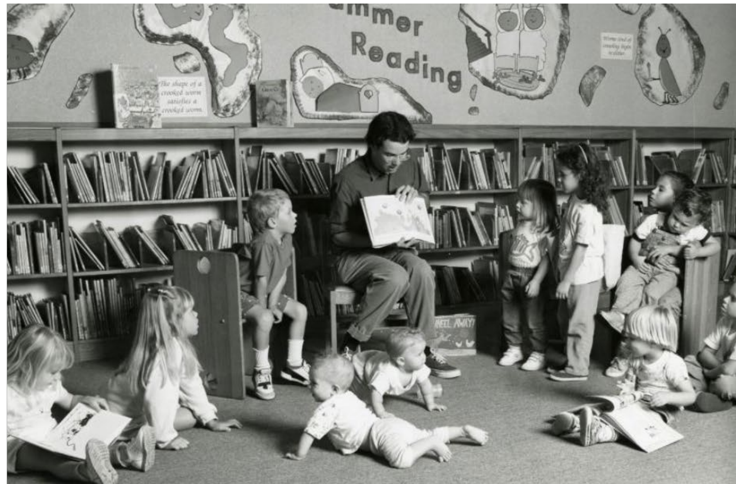
Goleta Valley Library, July 1990

Storytime through the years and across the miles!