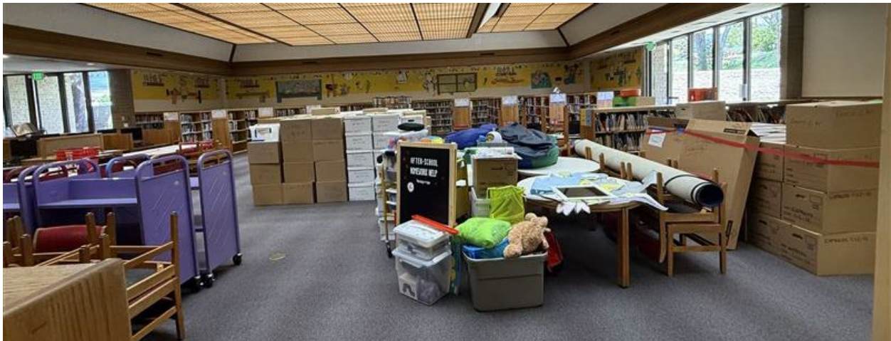
Goleta Valley Library being packed up and ready for the move to the temporary location.