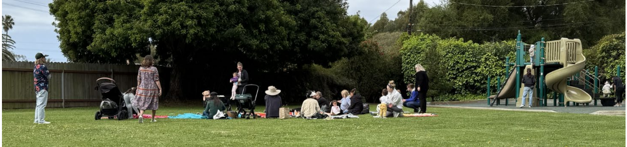
Friday, April 25 th Baby & Me Storytime and Wiggly Storytime at Santa Barbara Shores Park.