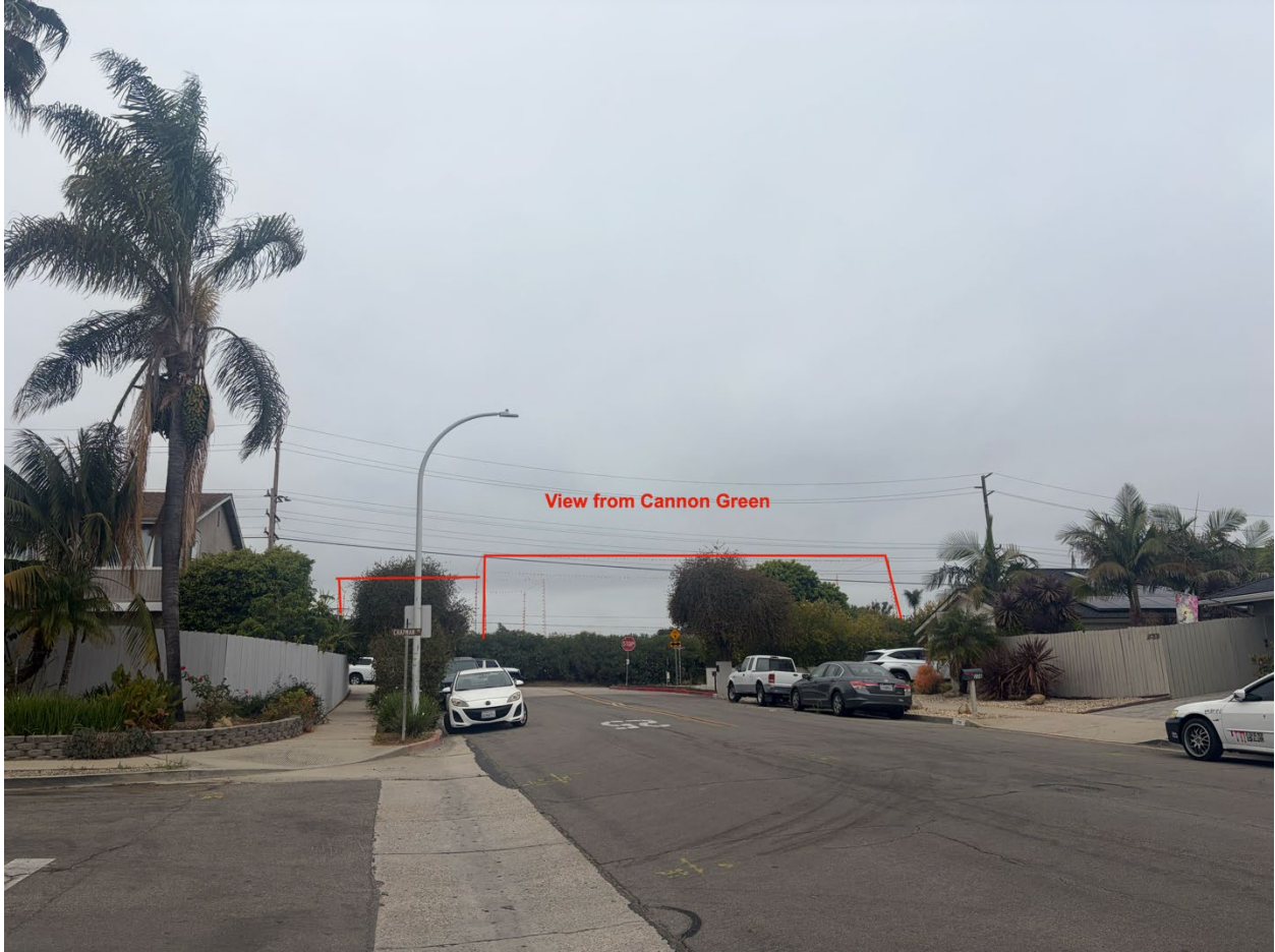
Photo taken from Cannon Green Drive/Chapman, showing the bulk as visible from the existing neighborhood.