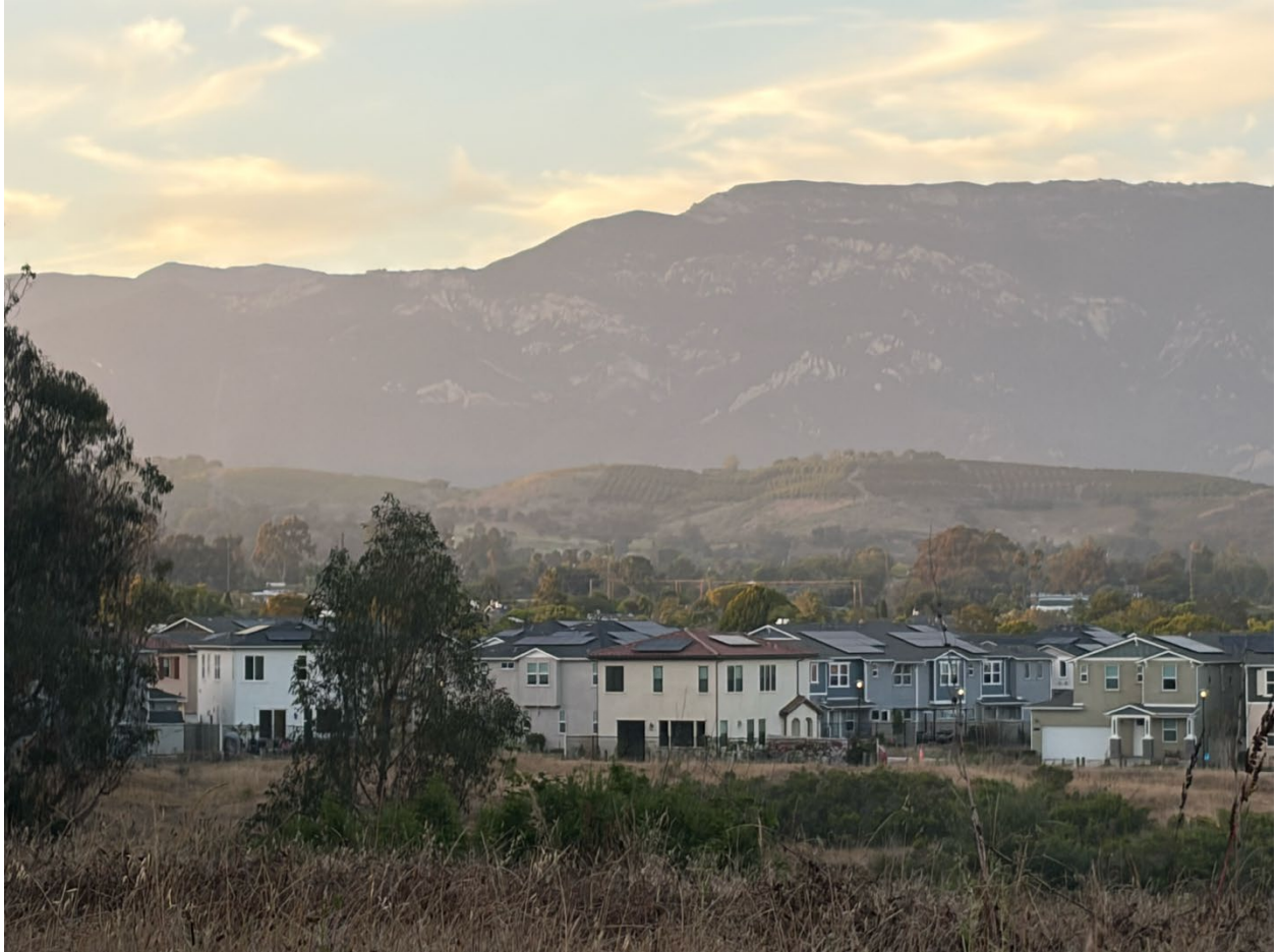
The project's impact will be visible from a distance, and stands well above any existing residential or commercial infrastructure