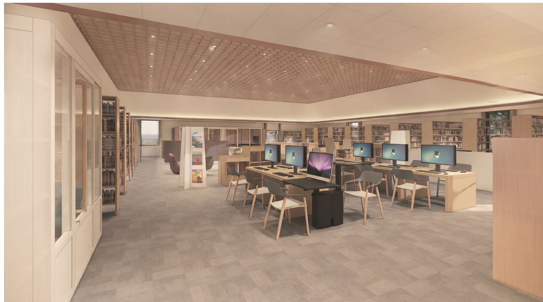
Adult Side of Library