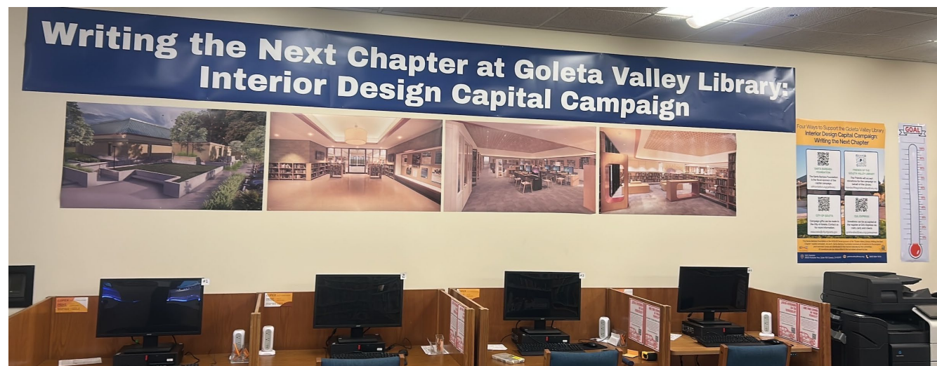
Display at GVL Express