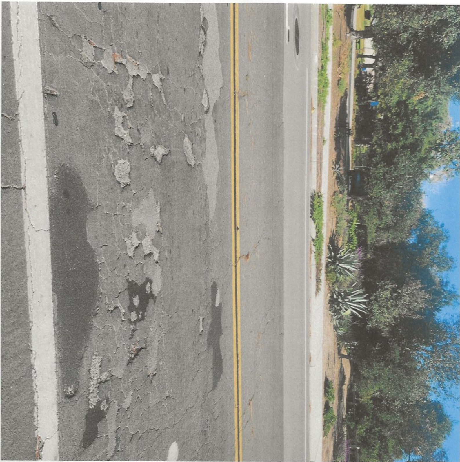
3 PHELPS RD + MILLS WAY LOOKING NORTH.