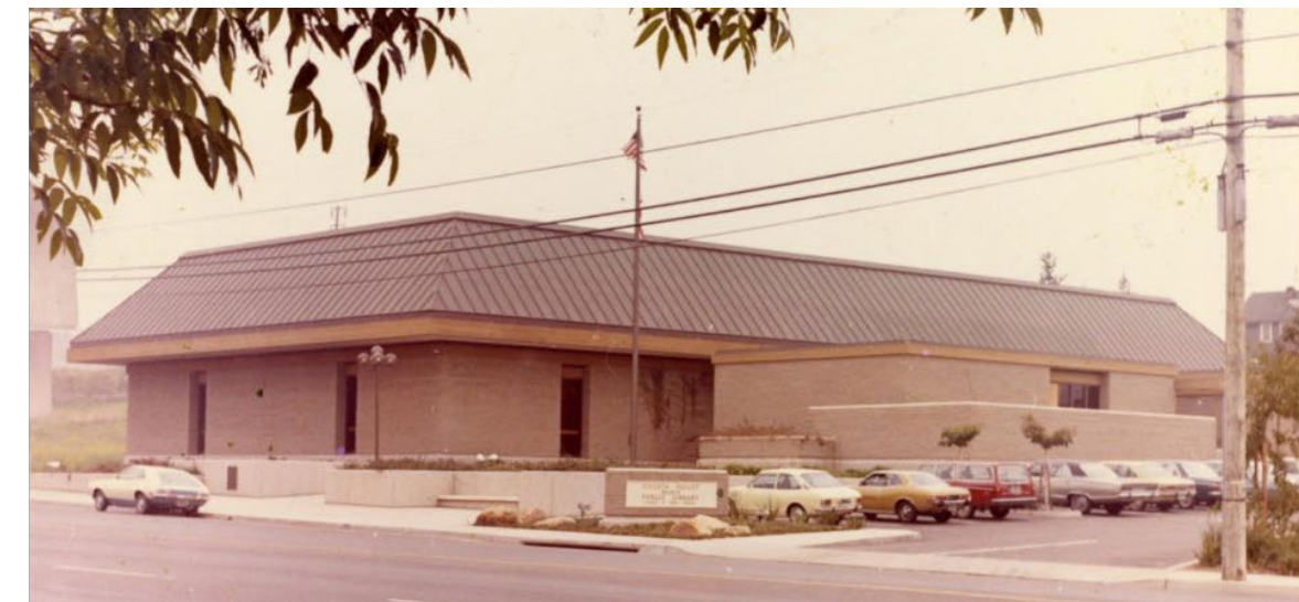
Goleta Valley Library, 1974