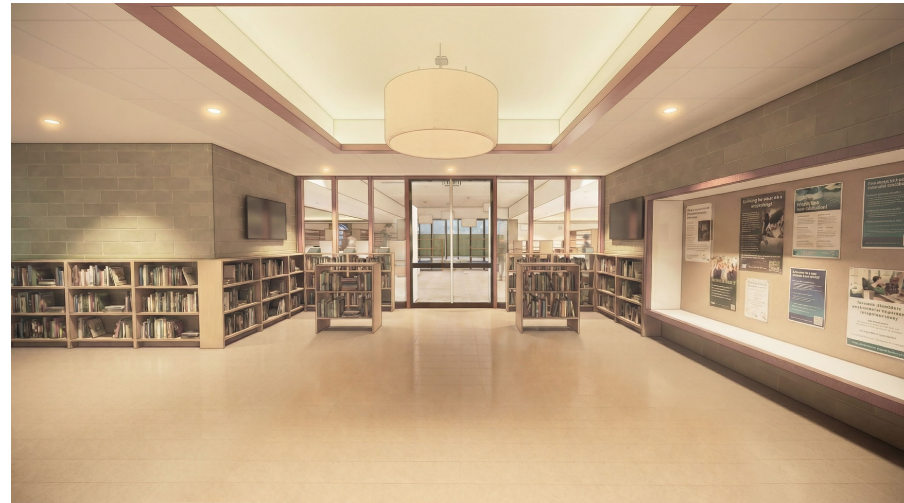
Library Lobby & Friends' Used Book Sale Area