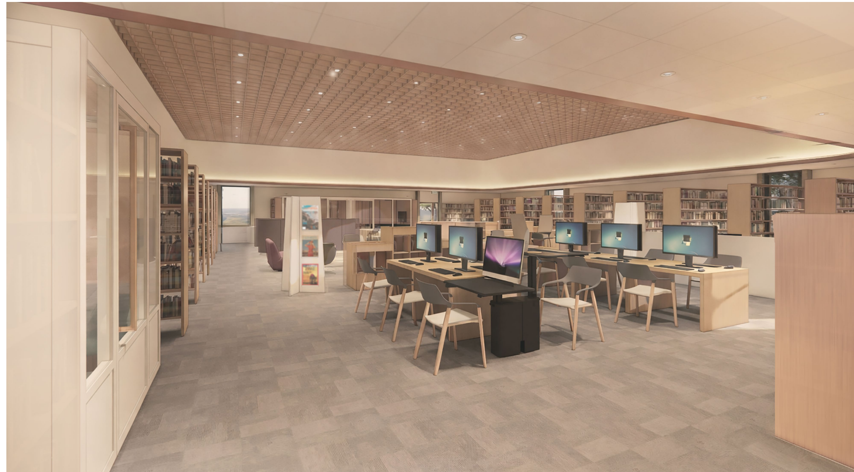
Adult Side of Library