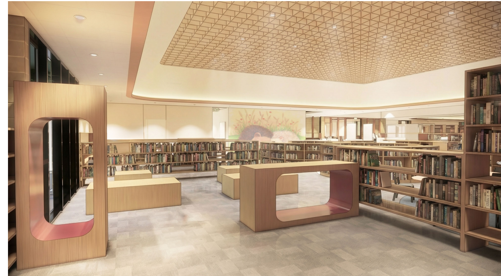
Children's Side of Library