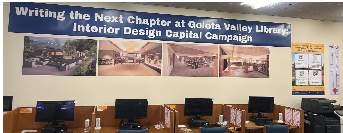
Display at GVL Express