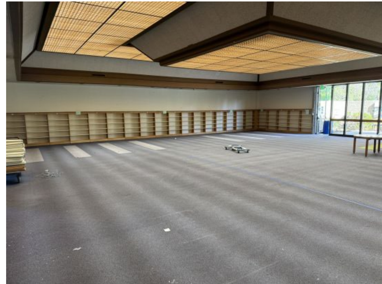
Getting ready for demolition at the Library