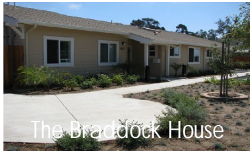
The Braddock House