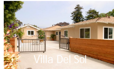
Villa Del Sol