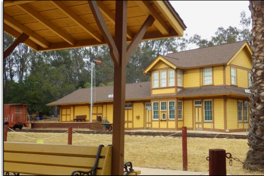
Historic Goleta Depot