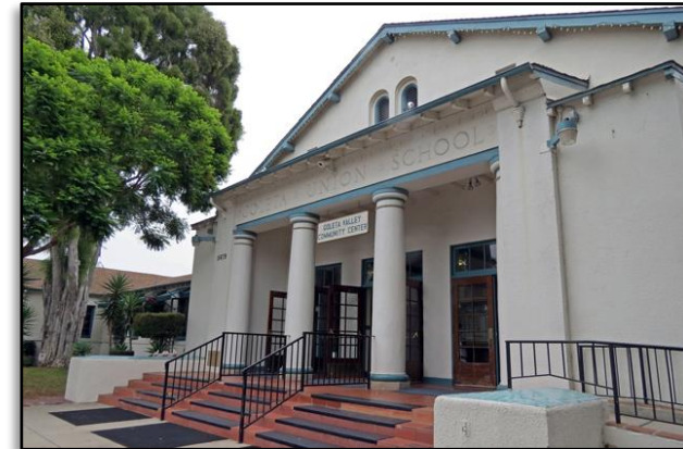
Goleta's Community Center