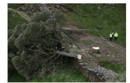
Sycamore Gap tree (Acer pseudoplatanus) Northumberland National Park, England

December 4, 2024, Public Tree Advisory Commission