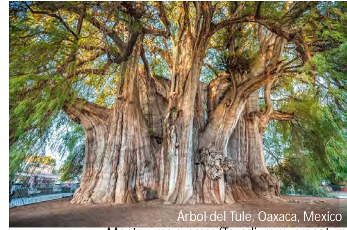
Montezuma cypress (Taxodium mucronatum)