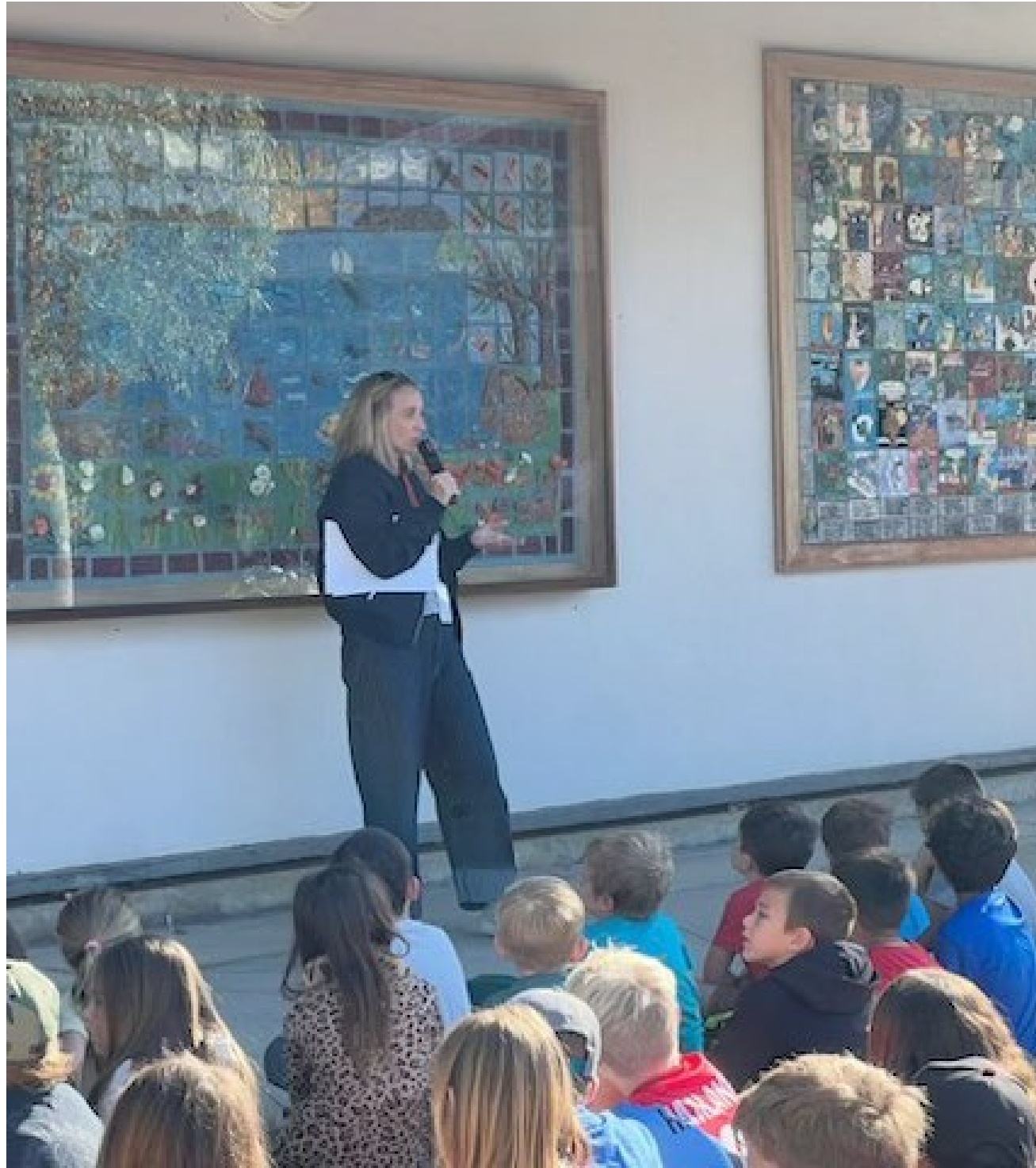
Children's Librarian presenting at Mountain View Elementary school-wide assembly