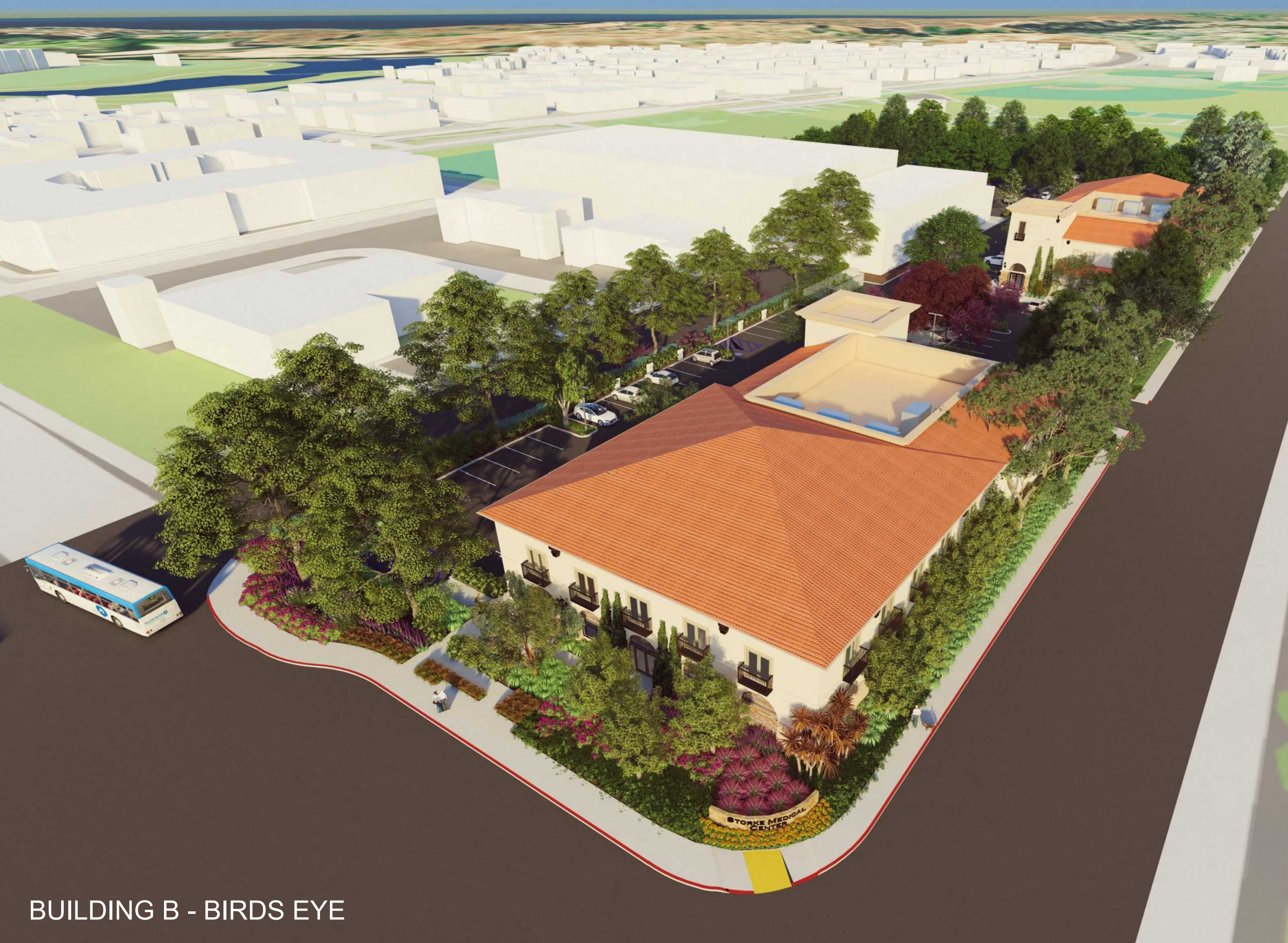
BUILDING B - BIRDS EYE