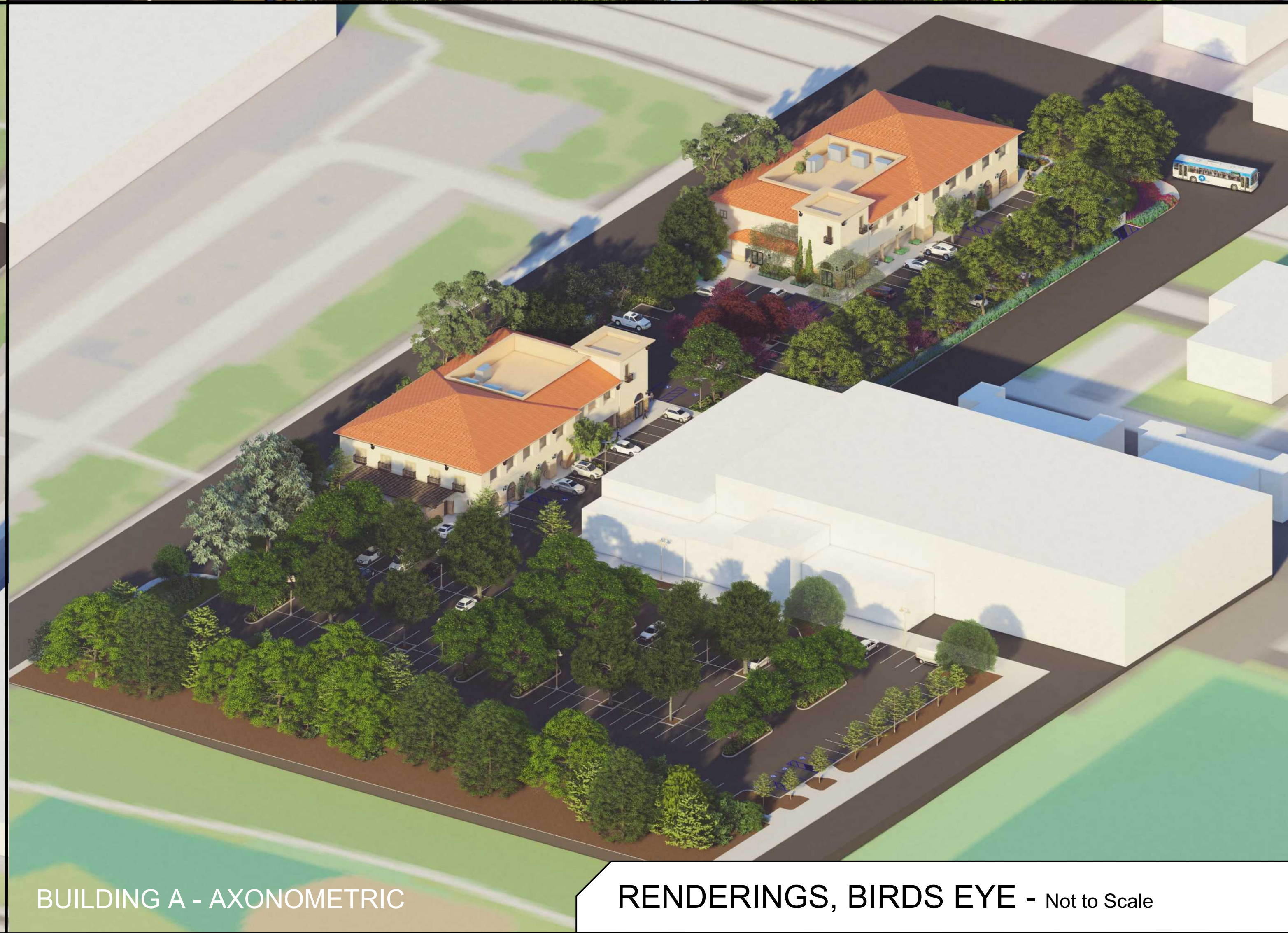
BUILDING A - AXONOMETRIC