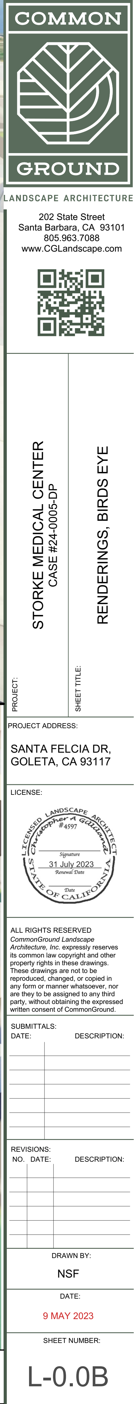
RENDERINGS, BIRDS EYE - Not to Scale