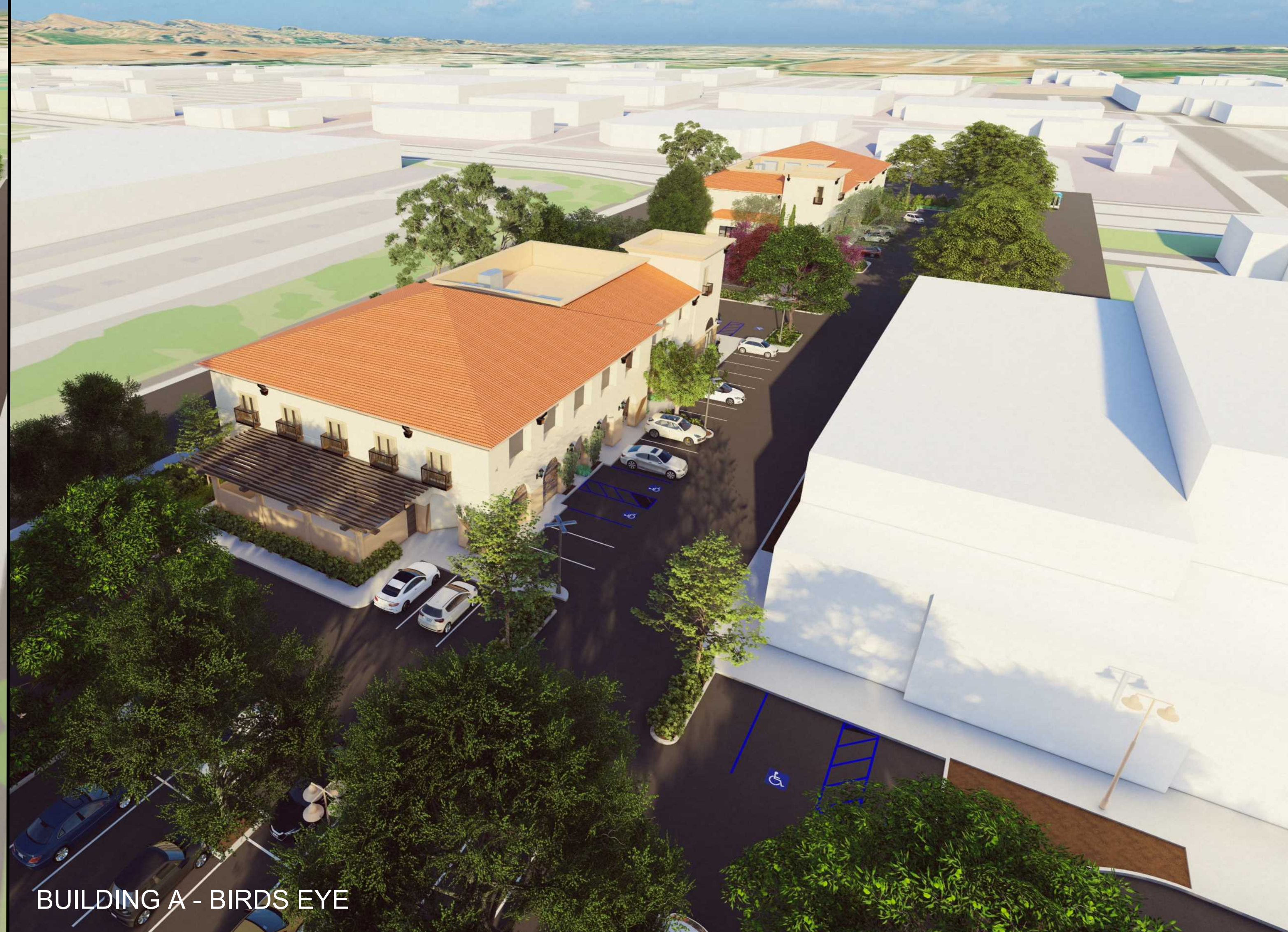
BUILDING A - BIRDS EYE