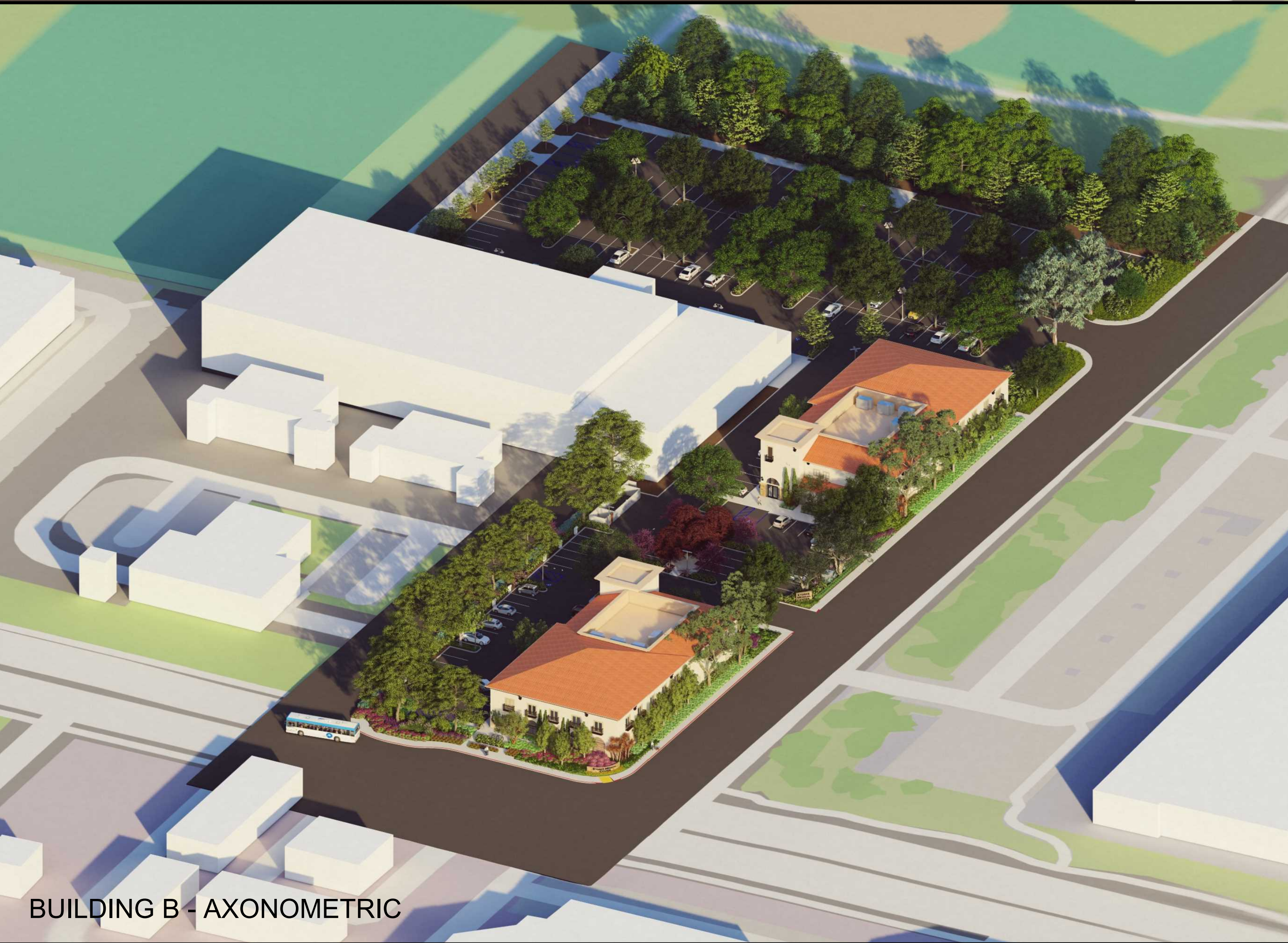
BUILDING B - AXONOMETRIC