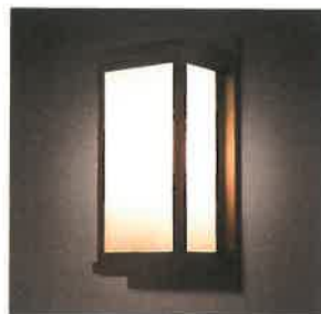
(N) EXTERIOR LIGHTING BRONZE FINISH