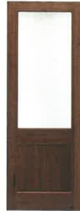
DARK WOOD (N) EXTERIOR HALF GLASS FRENCH DOOR COLOR