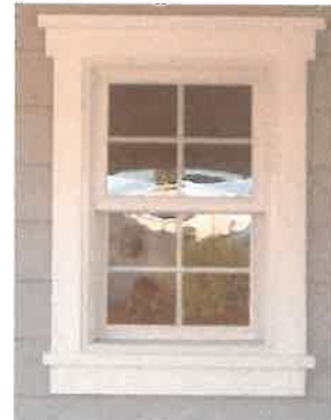
(N) WINDOW TRIM PAINTED WHITE TRELLISES TO MATCH