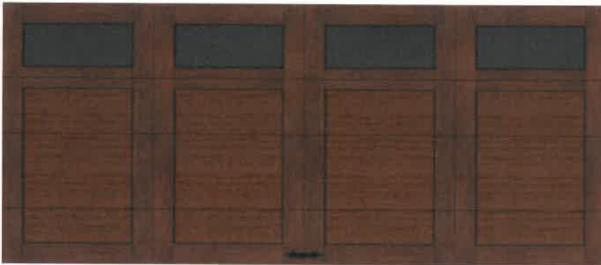
(N) GARAGE DOOR CLOPLAY CANYON RIDGE COLLECTION DARK STAINED WOOD