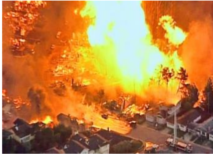
2010 San Bruno gas pipeline explosion

Beyond natural gas being unsafe, it is inherently not resilient. The reality is that major disasters such as earthquakes disable gas infrastructure for far longer periods than electricity infrastructure. As illuminated in the chart below from a San Francisco study, natural gas service requires 30 times longer to restore to the majority of customers than is required for electricity service. Worth repeating is the fact that gas infrastructure is also extremely vulnerable to fires, landslides, as well as terrorism.