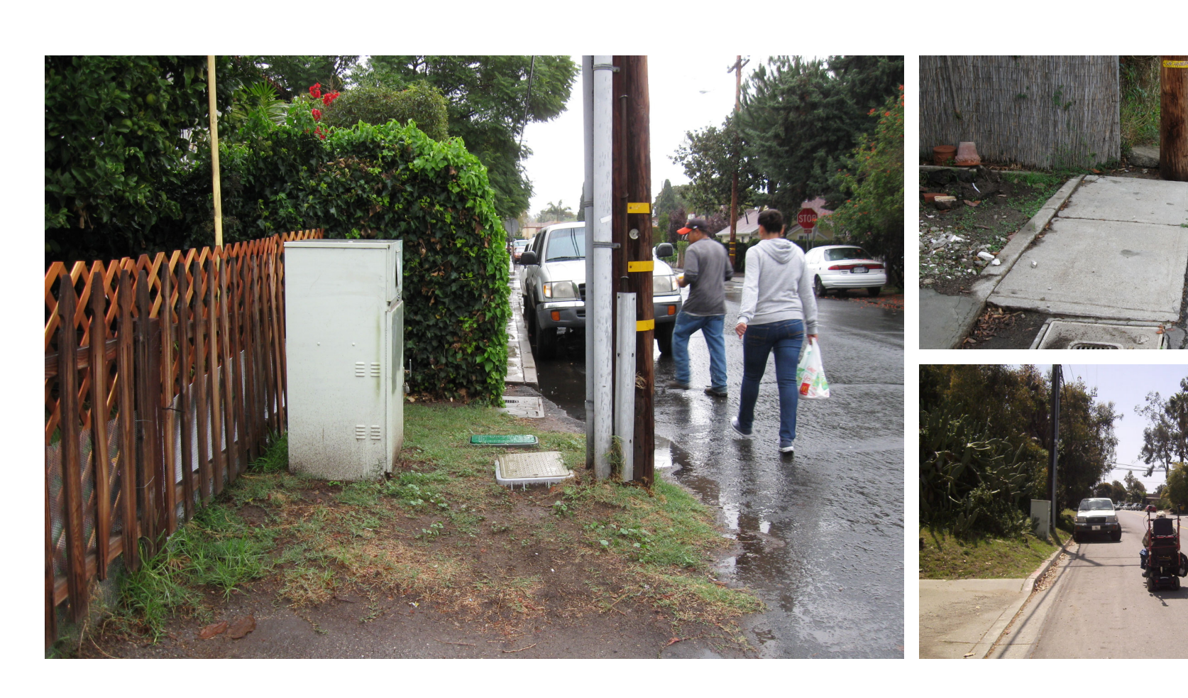
Private Encroachments and Utilities