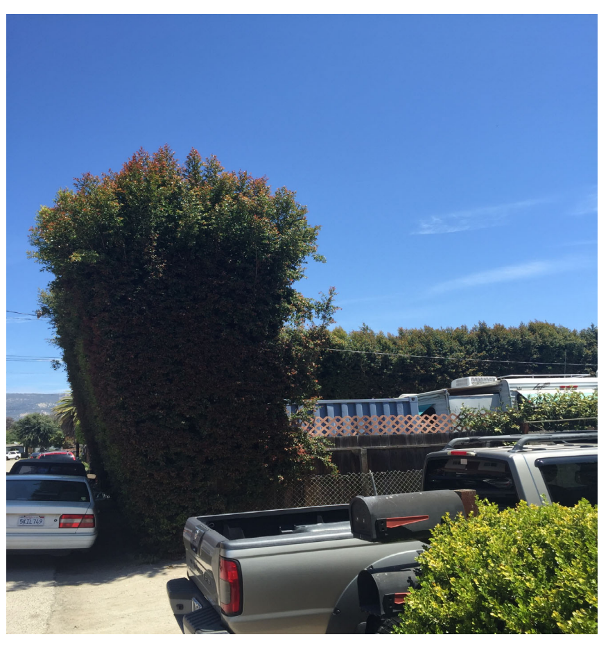
KEY ISSUES: sidewalks, parking, drainage