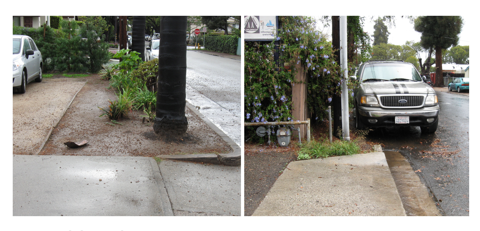
KEY ISSUES: sidewalks, parking, drainage