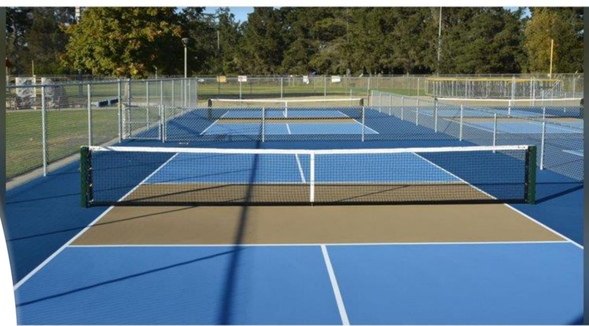
Through the joint efforts between the Santa Maria Pickleball Club, Recreation and Parks Department and People for Leisure and Youth, Inc., six brand-new pickleball courts are nearing completion at Hagerman Sports Complex off Skyway Drive.

Goleta Courts need improvement to be in-line with other municipalities